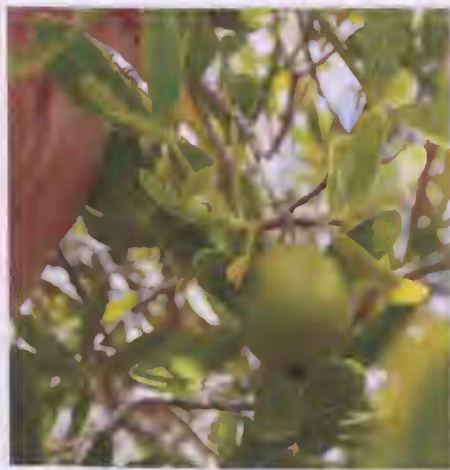
Fig. 2. Developing fruit of Gardenia fucata growing on sandstone outcrop near Cahills Crossing, East Alligator region, Kakadu National Park (CTM 4001). (Chris Martine)

While previous scat analyses (Telfer & Bowman 2006) and compilation of local Indigenous knowledge (Telfer et al. 1998) suggested that Black Wallaroos occasionally eat fruits and seeds, no empirical evidence for their role as effective seed dispersers has been previously established. Our results show that Black Wallaroos in the East Alligator region of Kakadu National Park occasionally ingest the fruits of Gardenia fucata and that those seeds are not only passed intact in scat but are also able to germinate at a high rate (100%; n=7). In